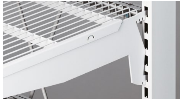
Wire shelf. Brackets allow mounting in different angels.

For simplifying shelf management, the system offers different accessories like dividers, front stops, price holder strips and others. Refilling is possible from rear or from the front. The robust design meets the tough challenges of a commercial environment. The system is available in black and in light grey.