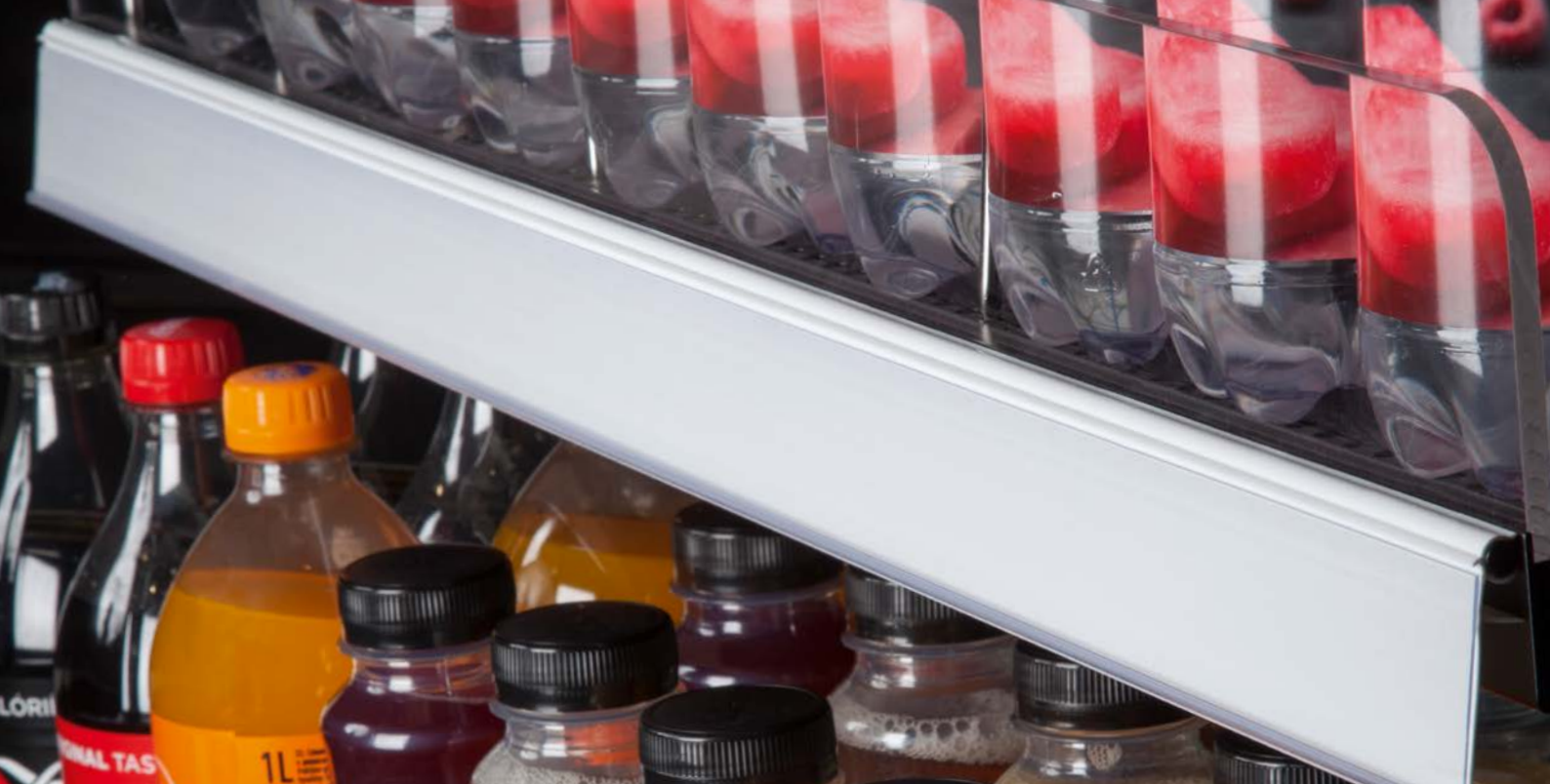
Transparent front stops allow quick and easy orientation.