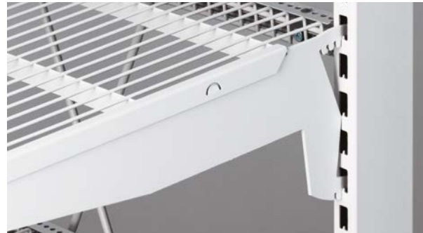
Wire shelf. Brackets allow mounting in different angels.

For simplifying shelf management, the system offers different accessories like dividers, front stops, price holder strips and others. Refilling is possible from rear or from the front. The robust design meets the tough challenges of a commercial environment. The system is available in black and in light grey.