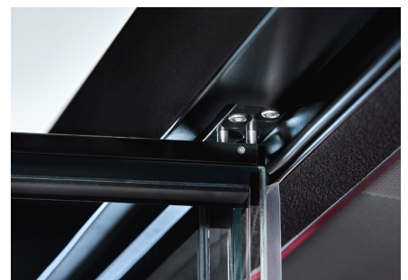
3-axis adjustability at the upper hinge