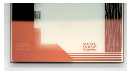
mystic black/opaque black (Logo on the left also in color matte stone grey)

ROBAX® IR SuperMax is available with the following decoration colors: