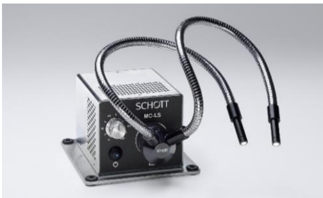
A20990 with gooseneck attachment