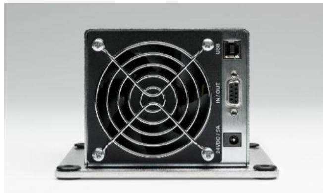
A 20990 Rear view