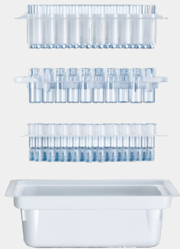
Broad ready-to-use portfolio