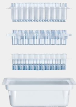
Broad ready-to-use portfolio