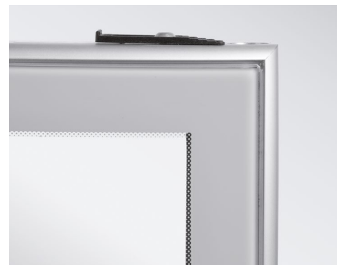
SCHOTT Termofrost® ECO-Clear AGD