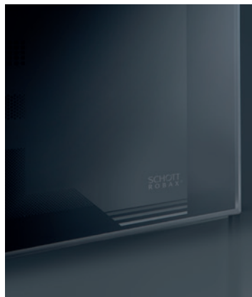
Frame decoration in modern black and logo in polar white and modern black printed on inner side of the panel