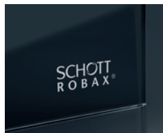
Logo in polar white*