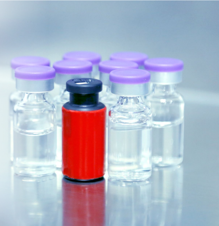
FIGURE 1: Smart Skin Technologies vial drone

With the help of a smart approach, which originated in the beer and beverage industry, pharma companies can now do exactly that. These analyses performed by Smart Skin Technologies combined with decades of research by the glass experts at SCHOTT allow pharma manufacturers to identify weak points in the filling system in real time. Thus, significantly improving their operating efficiencies, while reducing waste and line maintenance expenses. Here, representatives from four leading pharma players share their experience and use cases.