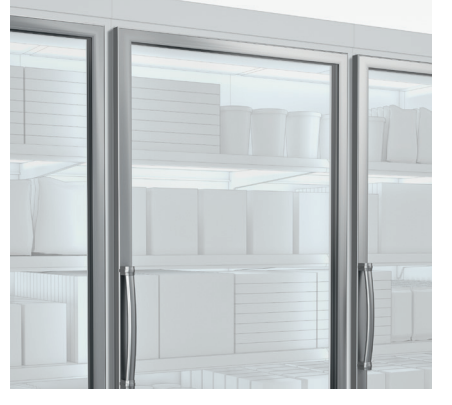
SCHOTT Termofrost<sup>®</sup> Classic Alu design