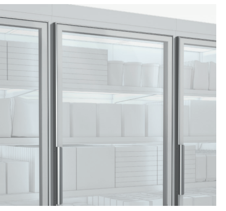
SCHOTT Termofrost® All glass design