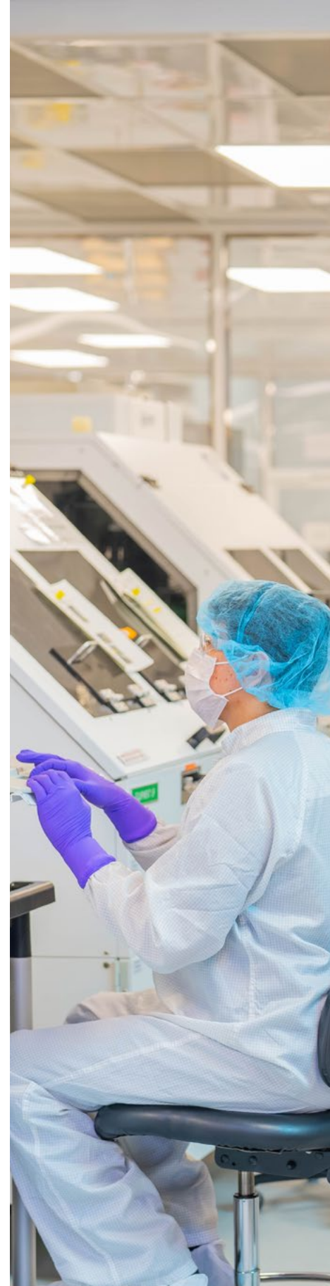
SCHOTT MINIFAB's high-precision, non-contact microarray printing fleet

Coupled with built-in scalability and design-for-manufacture (DfM) practices, the same microarray format used in discovery can often scale into translational or companion diagnostic development.