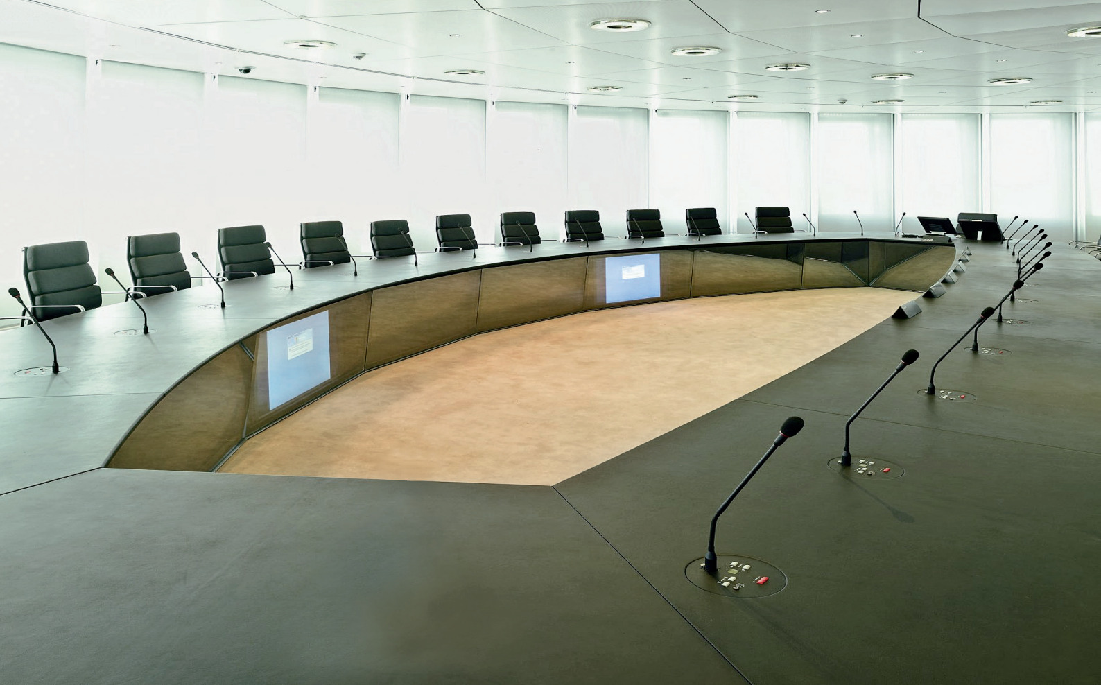
MIRONA® in a conference room at BMW AG