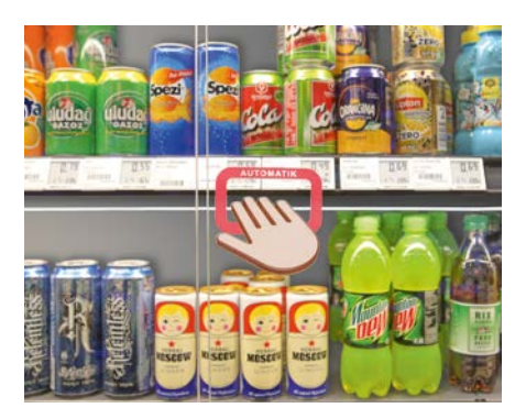
Entirely made of glass for a panoramic view