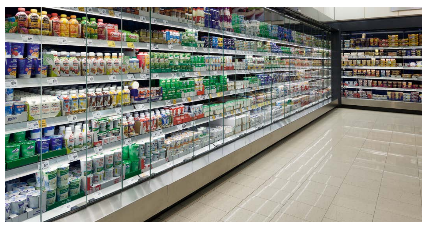
More comfort and visibility with intelligent glass doors

SCHOTT Termofrost® Smart Access: automatic glass door system