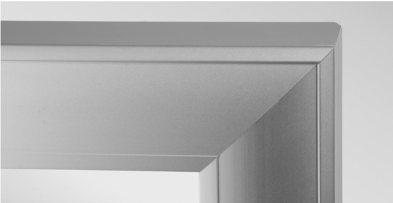
SCHOTT Termofrost® ECO-Clear X