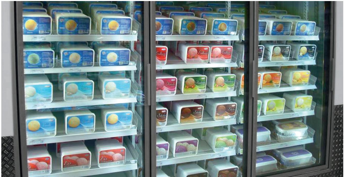
SCHOTT Termofrost® ECO-Clear is equipped with an anti-fog coating to reduce visible condensation.