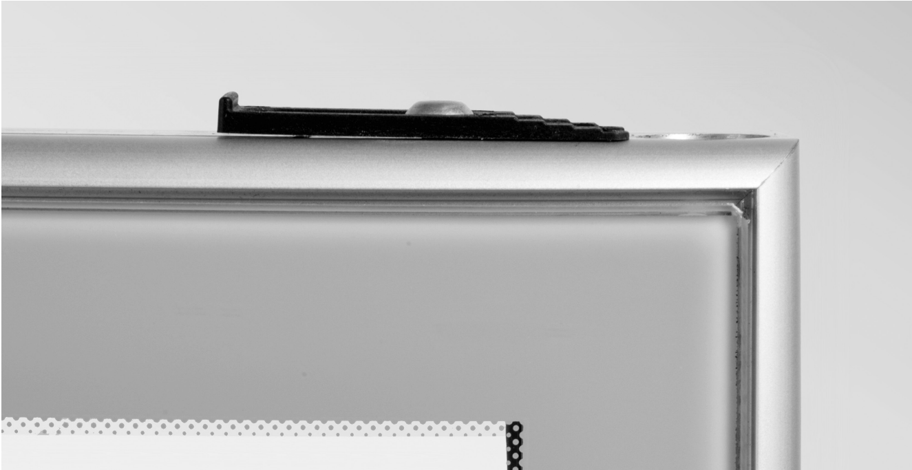
SCHOTT Termofrost® ECO-Clear AGD