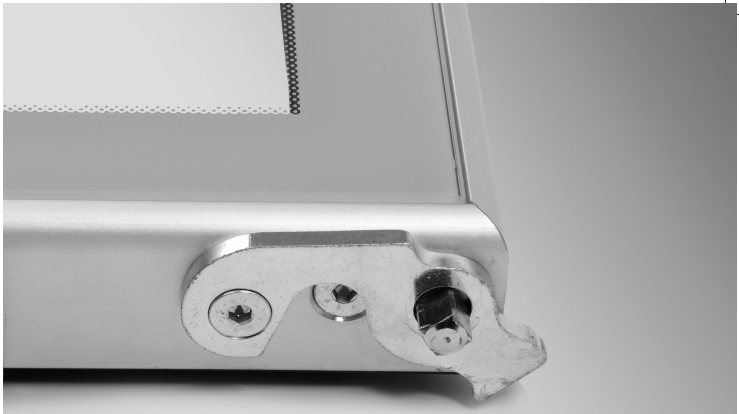
Doors can be used for left or right side mounting.