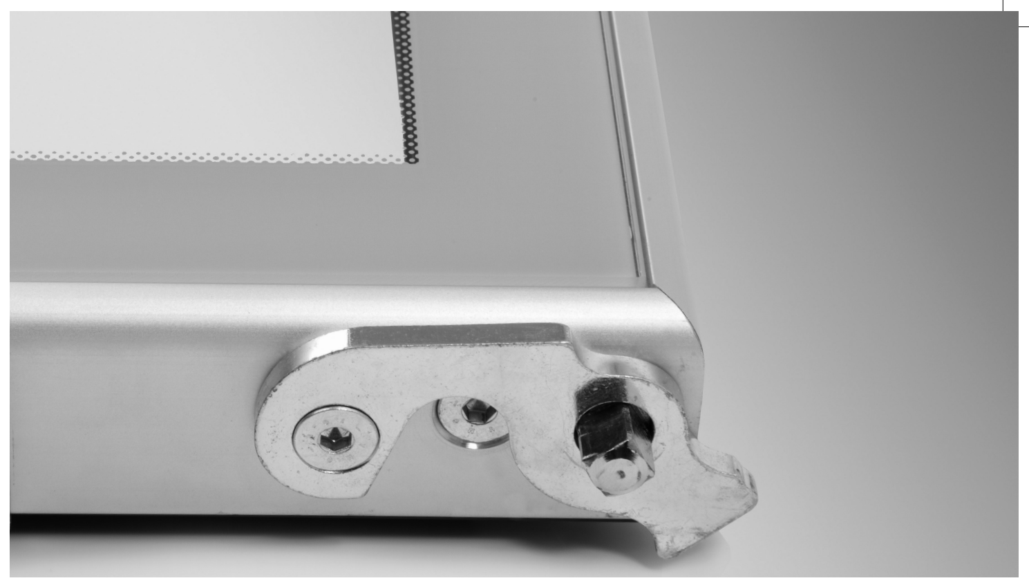
Doors can be used for left or right side mounting.