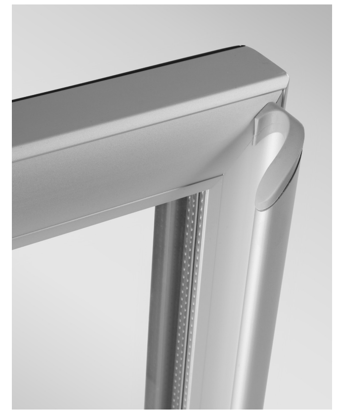
SCHOTT grip Integrated handle