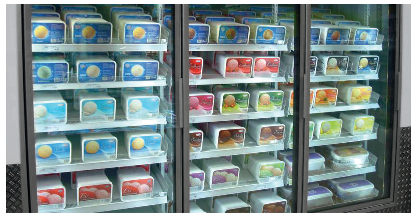
SCHOTT Termofrost® ECO-Clear is equipped with an anti-fog coating to reduce visible condensation.