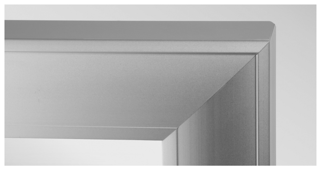
SCHOTT Termofrost® ECO-Clear X