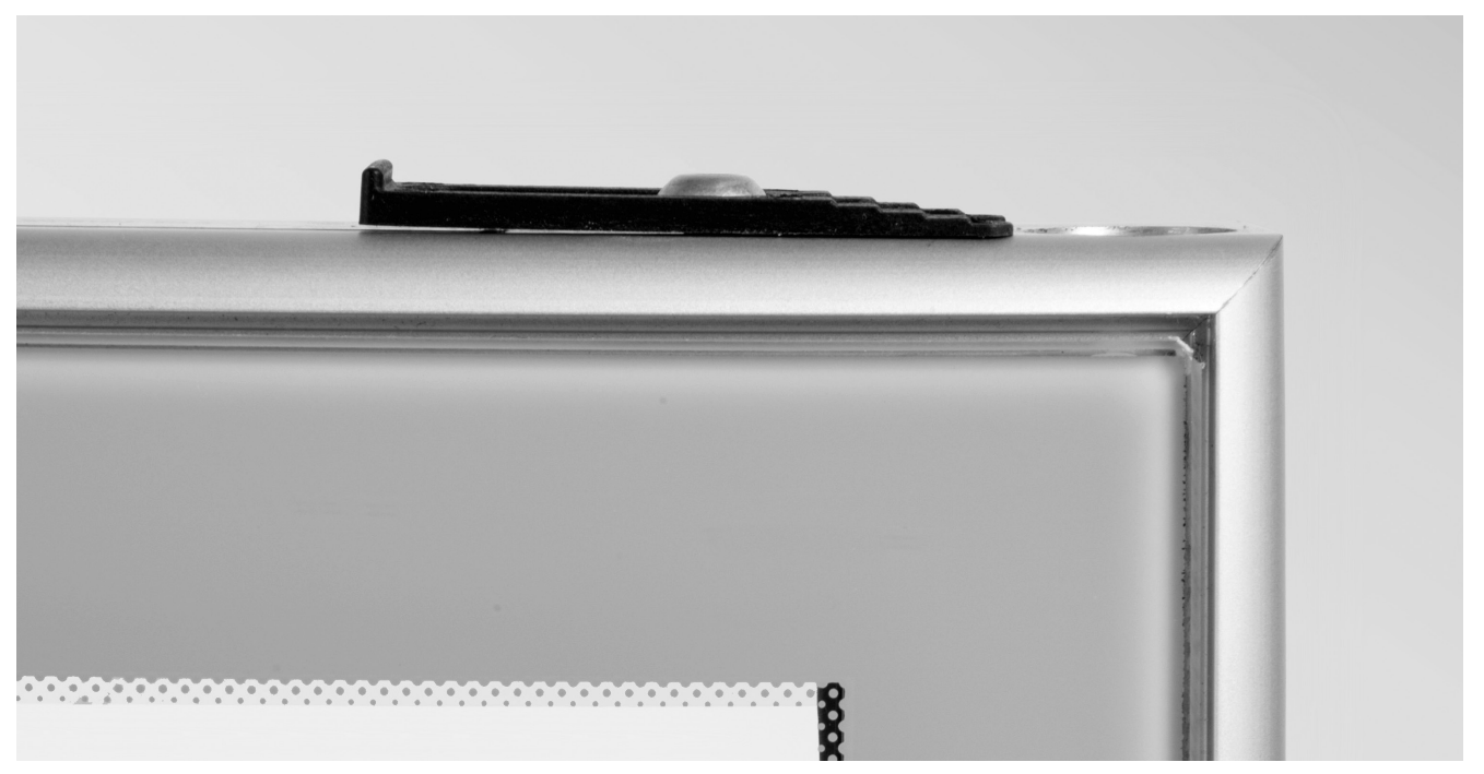
SCHOTT Termofrost® ECO-Clear AGD