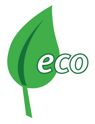
Energy Saving Solutions Each SCHOTT Termofrost® product aims to improve the eco-friendly characteristics of cooling units for the food retail industry.

SCHOTT Termofrost® ECO-Clear X doors are designed with aluminum rails that are known for their durability.