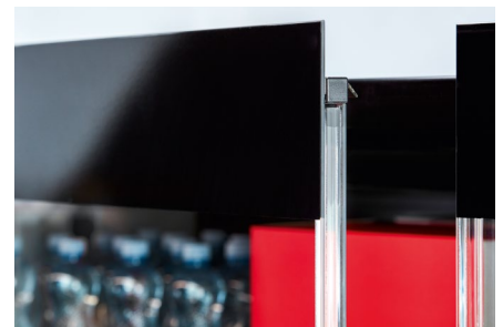
Extended doors for chiller cabinets