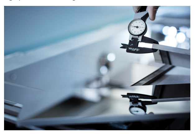
pic_03: Measurement in the micrometer range