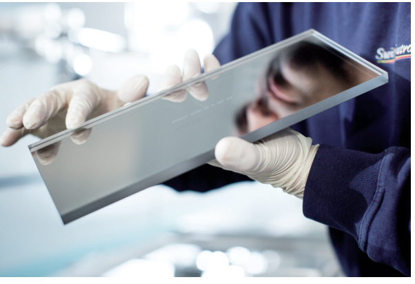
pic_06: Nano-thin reflecting surface during final visual inspection