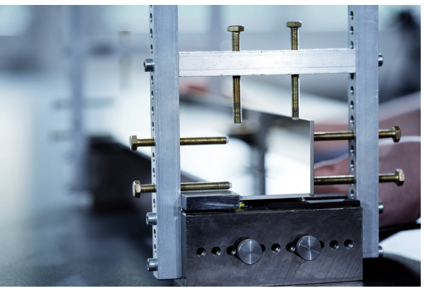
pic_02: Adjusting the reflecting surfaces