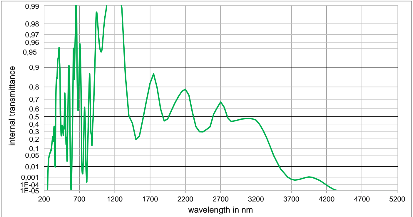
Internal transmittance \tau_i at reference thickness The internal transmittance values, tabulated and graphically represented, are reference values only