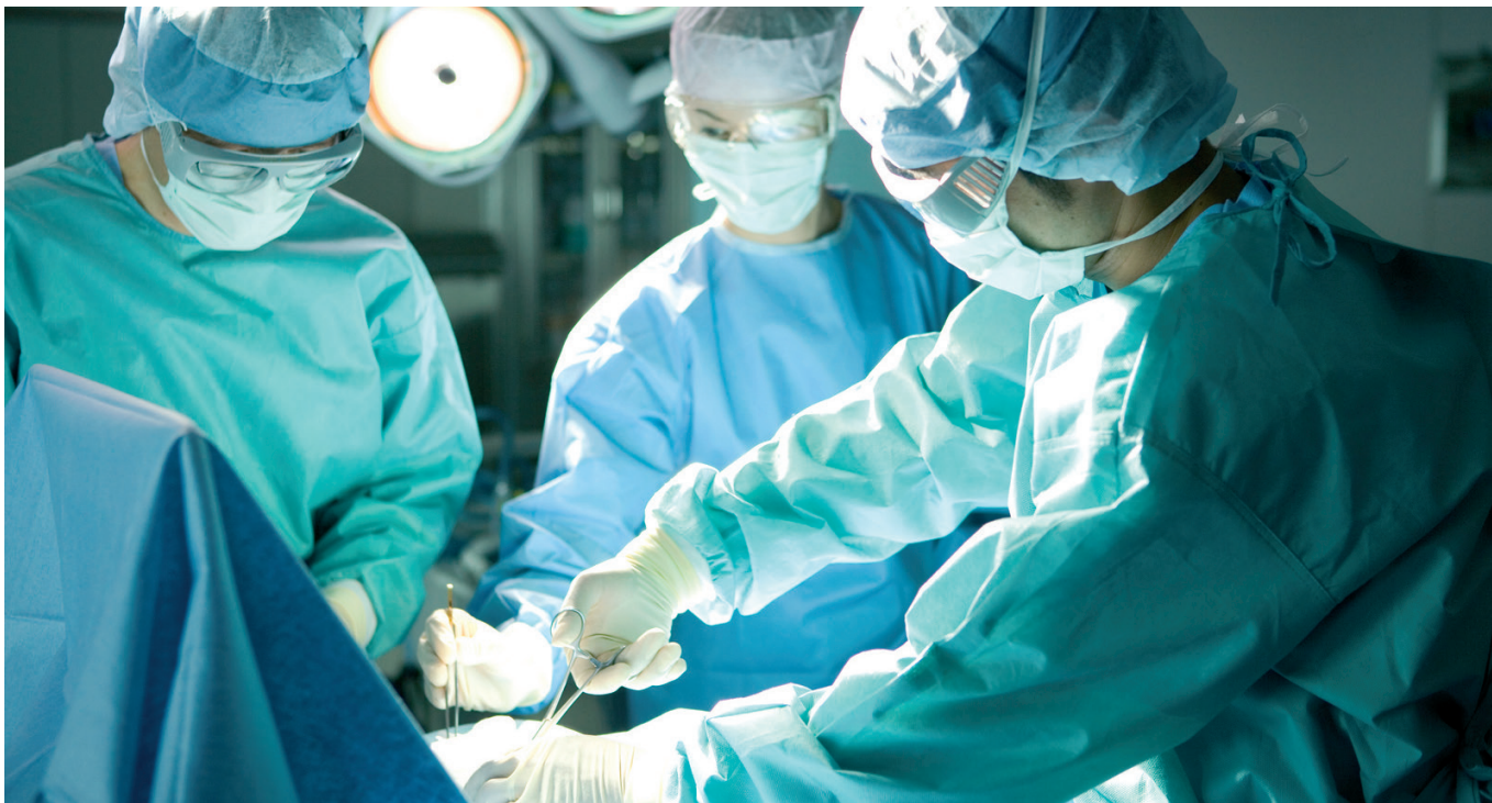
Autoclavable connectors enable superior reliability and performance in operating room devices