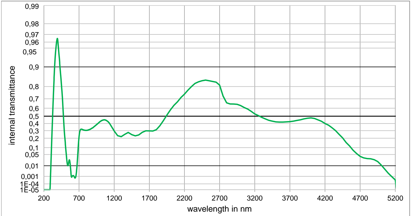
Internal transmittance \tau_i at reference thickness The internal transmittance values, tabulated and graphically represented, are reference values only