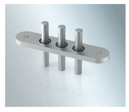
For 24 – 48 V applications requiring higher currents

SCHOTT also offers standard solutions or can design and manufacture customized options to meet specific requirements. Our CompRite<sup>™</sup> e-Compressor Terminals production facilities are IATF (TS 16949) certified.