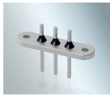
For 200 – 500 V applications