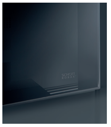
Frame decoration in modern black and logo in polar white and modern black printed on inner side of the panel

SCHOTT North America, Inc. 5530 Shepherdsville Road Louisville, KY 40228, USA Phone (800)822-0600 info.robax@us.schott.com