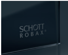
Logo in satin silver*