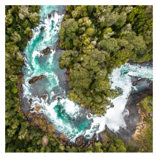
SCHOTT AG has set itself an ambitious goal in order to fulfill its responsibility towards the environment and the advancing climate change: The company wants to become climate-neutral by 2030.

We have embarked on the path toward climate neutrality, but we do not know all of the solutions yet. One thing is certain: we will not be able to produce CO2-free in 2030 because the development of new technologies and their large-scale introduction into production takes time and requires high investments. The CO_2 emissions which can't be avoided technologically in 2030, will be fully offset by a sustainable compensation portfolio.